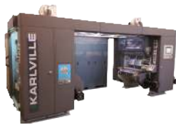
Pack Ready Laminator