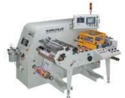
K2- shrink sleeve seaming