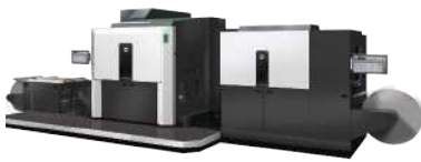
HP Indigo 20000